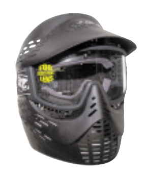
Always wear Paintball Approved Goggles