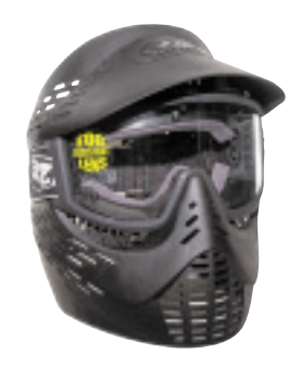
Always wear Paintball Approved Goggles