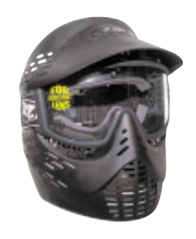
Always wear Paintball Approved Goggles